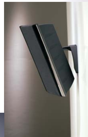
Panoramic positioning possibilities