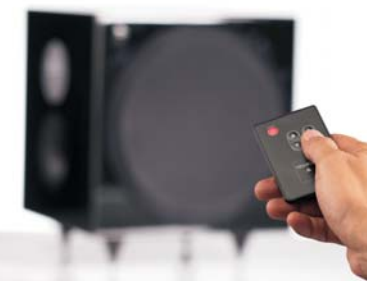
Enclosure with remote control